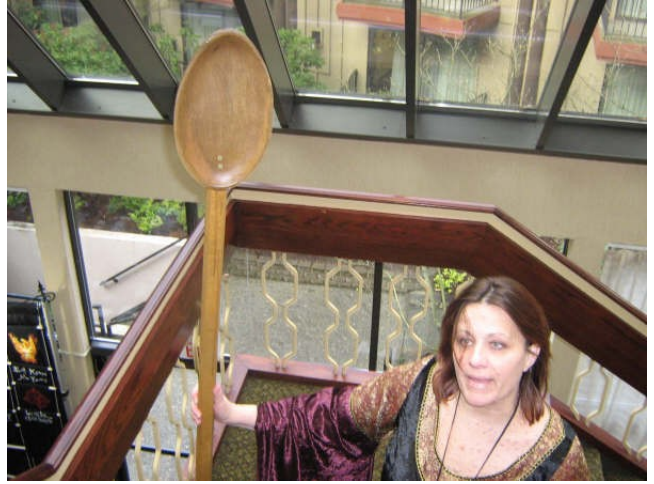
(Don't look at me, I have no explanation)