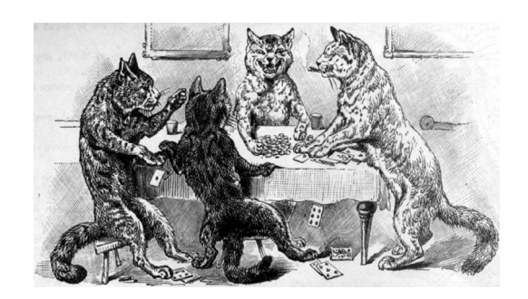
Lloyd Penney, 1706-24 Eva Rd., Etobicoke, ON, M9C 2B2, penneys @ allstream.net, April 30, 2008

((Me, I define science fiction as books, or short stories, words on paper; I don't expect much from TV or film versions of SF. I define conventions as one of the few places I can enjoy socializing, and not often even at conventions, anymore.))