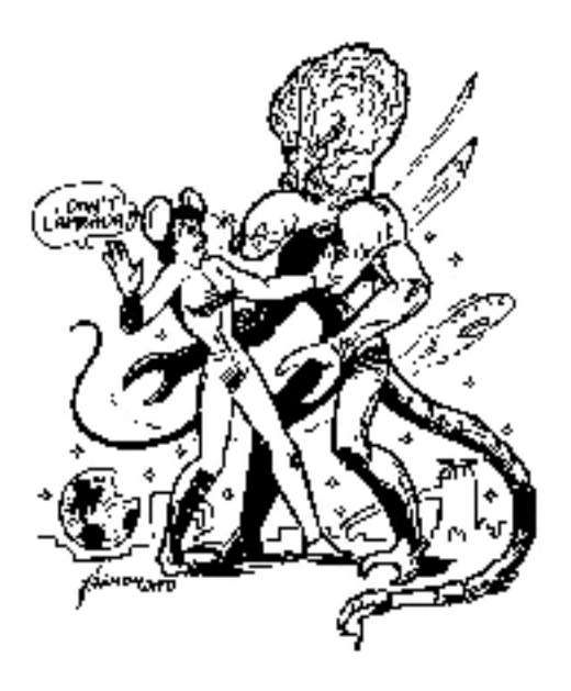
"This Island Cheese" (T. Hammell)