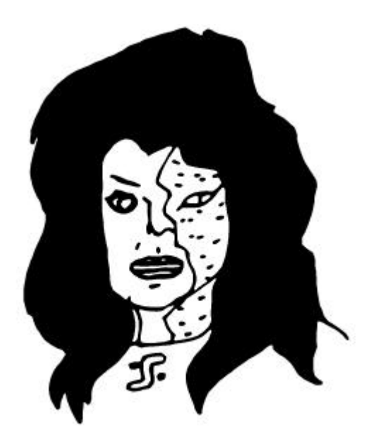
Remember that foolish "V" miniseries?