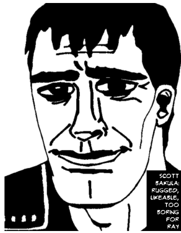
SCOTT BAKULA: RUGGED, LIKEABLE, TOO BORING FOR RAY