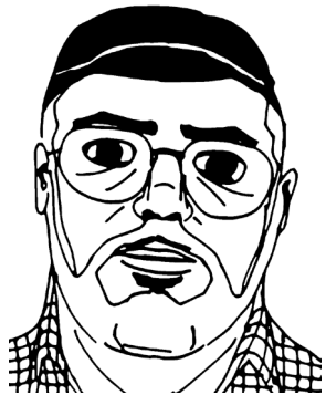
J. MICHAEL STRACZYNSKI: KEEP RUNNING UP THAT HILL