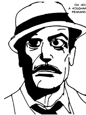
OH NO! A KOLCHAK REMAKE!

Not too much happening in the pilot category. ABC has ordered a new series from Shaun Cassidy (creator of American Gothic and the never-seen Hollyweird ). The only thing known about it is that it's set in a small Florida town after a category five hurricane and weird things start to happen. The other upcoming pilot is an updating of the 1970s classic science fiction series Kolchak: The Night Stalker . And that's about it for pilots.