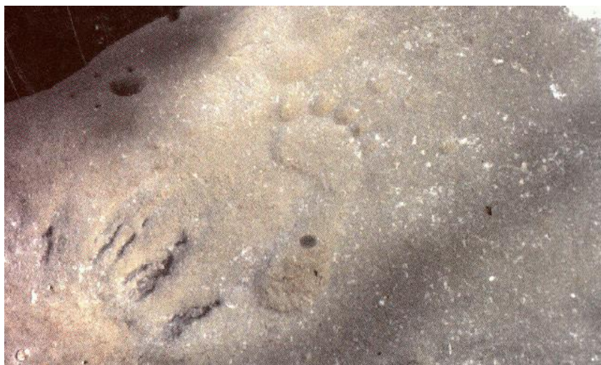
(The foregoing picture is supposed to be a fossil footprint or two)