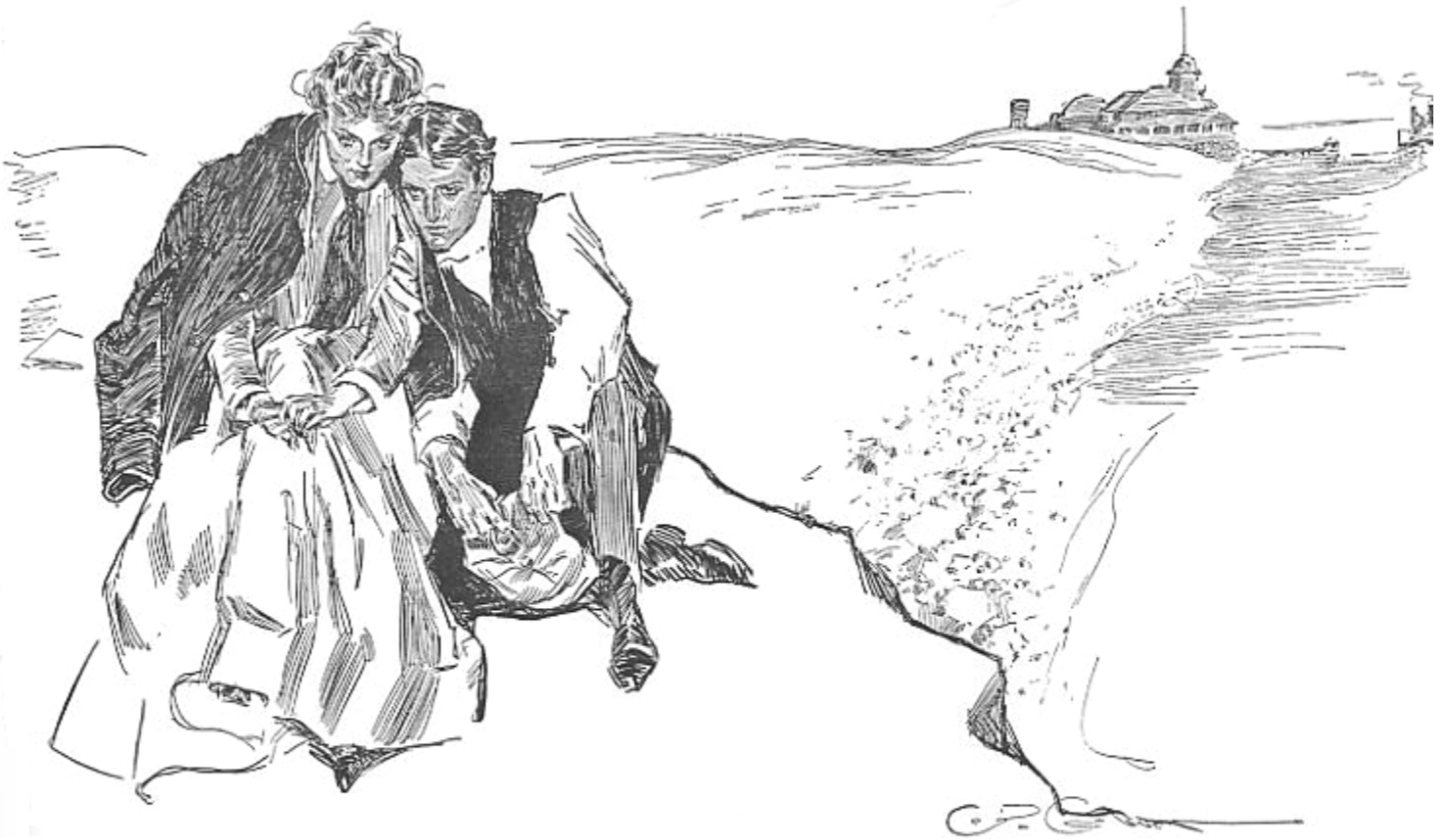
THE LAST DAY OF SUMMER