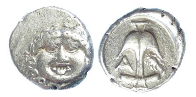
Apollonia Pontica, Thrace, AR Drachm, 450-400 BC

I haven't written an addition to my coin history articles in quite a while. At least a year, I should think, and for good reason. My finances being what they were, it's been that long since I've bought a coin. However, the dark clouds over my assets have gradually drawn aside, and I thought I was in a position finally to make a modest purchase.