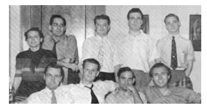
Photo Source: "Alternate Worlds, The Illustrated History of Science Fiction" by James Gunn. Prentice Hall 1975.