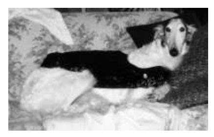
Imperial Wedding Puppy Jessie

Nothing else can get up it. Certainly not a moving van. The drive is about 70 feet high (and 'high', rather than 'long', is the more appropriate word). Very steep it is.