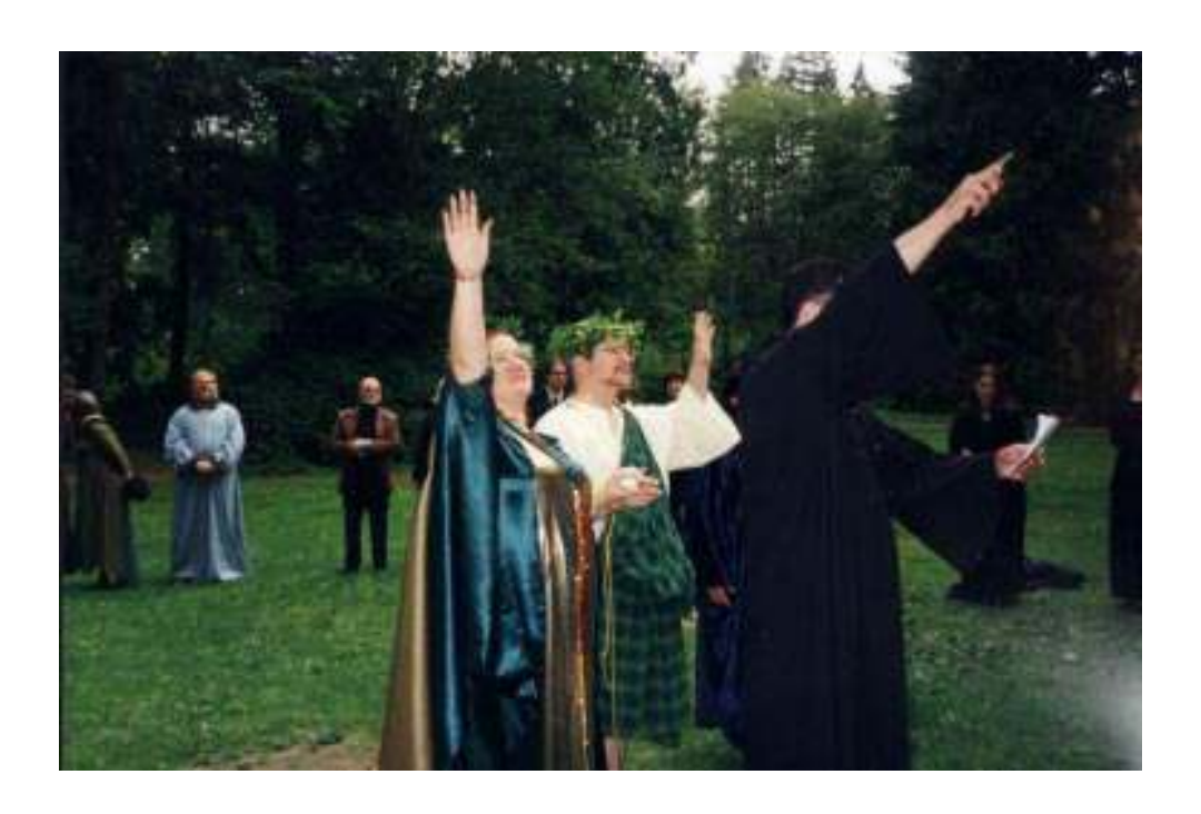
Saluting the Four Winds