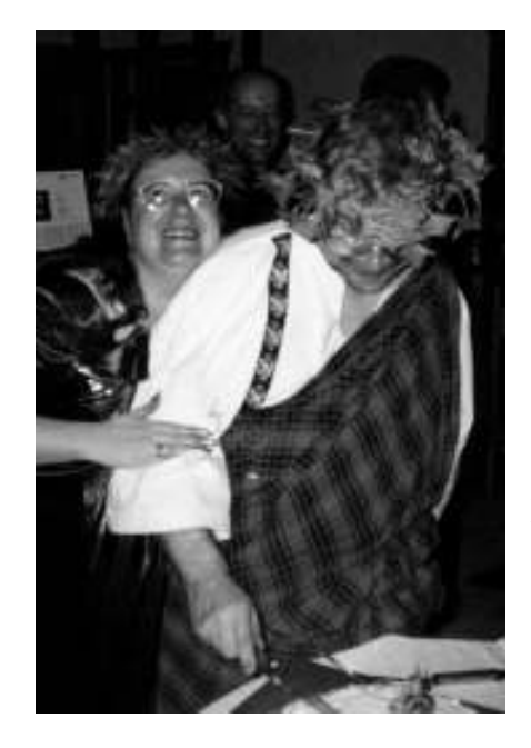
Bride finds large object in Groom's kilt

I was determined to relax and enjoy myself, and as part of that consumed a goodly amount of wine meself. The last few hours of the reception are consequently a bit fuzzy in my memory (but then, so is everything else. I used to worry about it, till I realized I've always been like this).