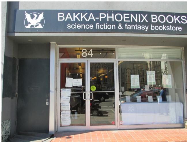
Storefront on Harbord St. near Spadina