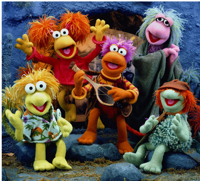
The Usual Gaggles of Fraggles