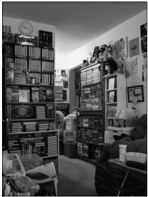
Now imagine you have half as much space.

Note to print readers: underlined events have an associated URL. Links are included in the PDF version at <u>http://www.efanzines.com/BCSFA/.—Julian Castle</u>