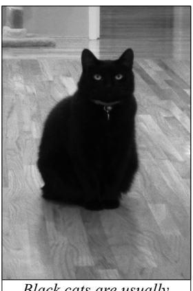
Black cats are usually aware of things anyway.

17 August and 21 September 2014 ( third Sunday ): <u>Board Game Swap Meetup</u>, 11 AM–1 PM at Board Game Warriors, 708 Clarkson Street, New Westminster.