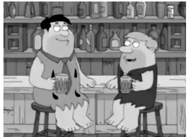
The Flintstones on Family Guy.

MacFarlane says that the characters will look the same as before, but the stone-age-technology comedy will be updated: “What is the animal version of an iPad?” (An iPaw?)