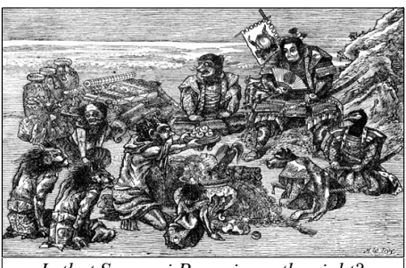
Is that Samurai Penguin on the right?