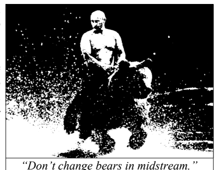
"Don't change bears in midstream.

[He's all about the future. It is, after all, where we are going to spend the rest of our lives.]