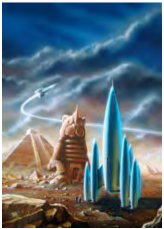
Sample poster art.