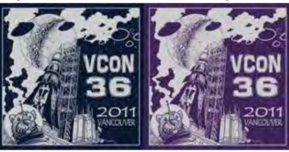
Sample T-shirt art.