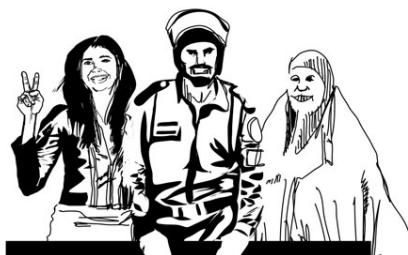
(Printed flyer from Egyptian revolution.)