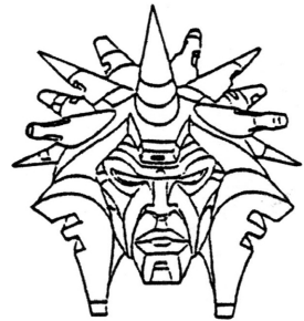
QUINTESSON JUDGE: THE "WALTER BISHOP" FACE

Besides, if I were in charge of BBC One, I would start broadcasting Doctor Who season six on Saturday 22 October, air seven episodes (that would end on 3 December), take a 35-day break for the holidays, then start showing series seven on 7 January 2012 with another seven episodes (that would end on 18 February). See, almost all of Britain has the same kind of weather conditions between the start of October and mid-March as Southwestern BC, Western Washington, and a good part of Oregon has in those same months: "rain." So a lot more people will be sitting